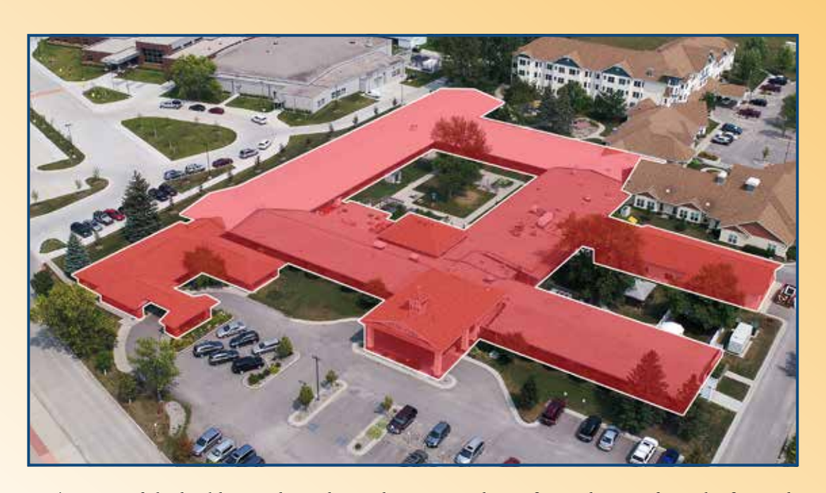
The areas of the building indicated in red experienced significant damage from the fire and will be rebuilt.

The building was designed in an age before community and activities were a top priority, so there was limited common space. As time passed and care models changed, eldercare communities began to implement a "neighborhood model"—intentionally designed spaces and programs that fostered community, connection and a feeling of home. Fargo Elim worked to achieve this neighborhood model through our programs and staffing for many years, but the 1960s building design held us back from fully achieving it.